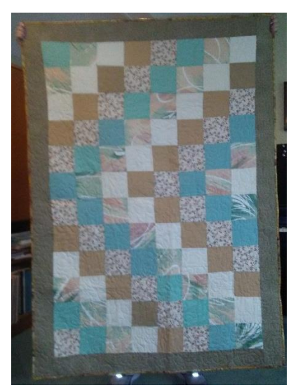
Unknown (please drop me a note so we can acknowledge you next month!)