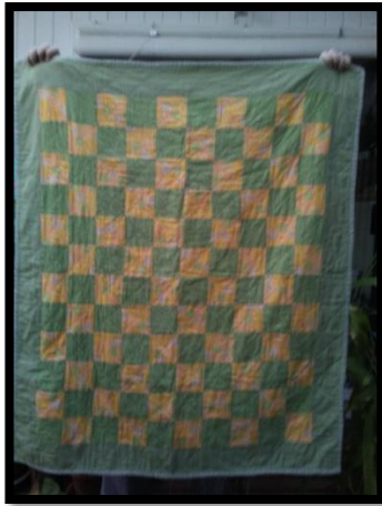
Unknown (from Ohio)