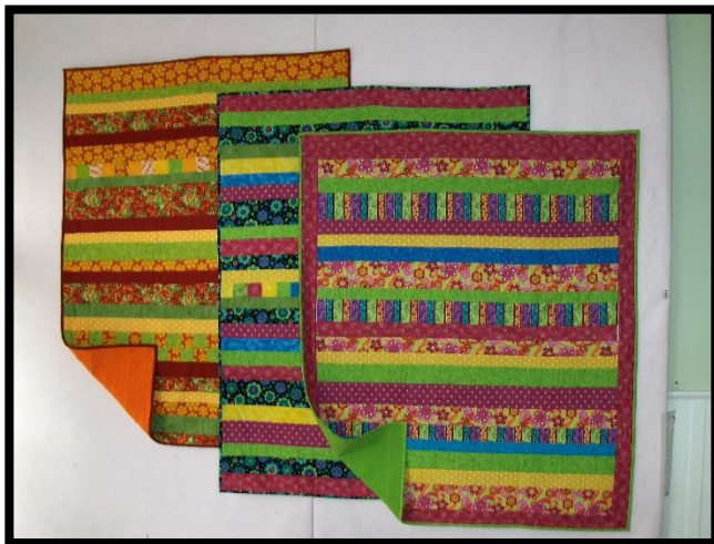
Left: Sleep in Heavenly Peace quilts