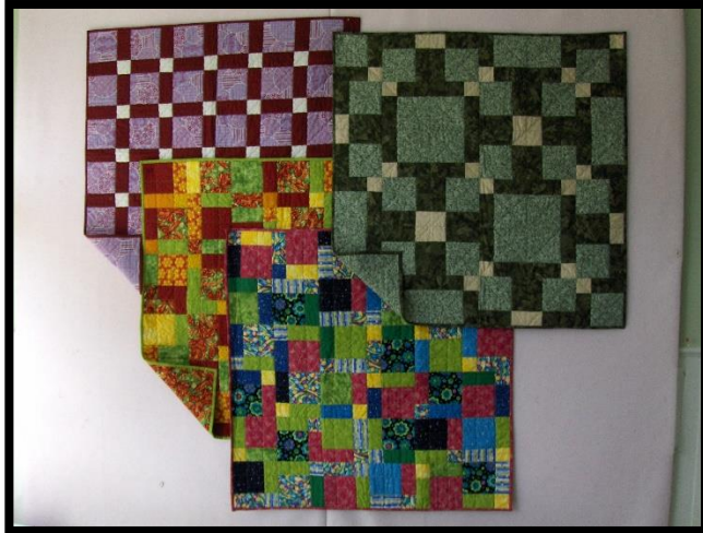
Left: More lap quilts for Vets!