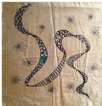
Pam Doffek/Lyn Gearity, BOM Chairs

Here's some pix of 2 completed blocks, one pieced the other pigma/ink pen.