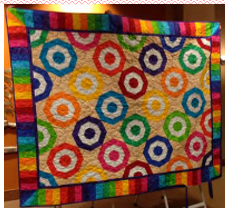
The 2016 Opportunity Quilt