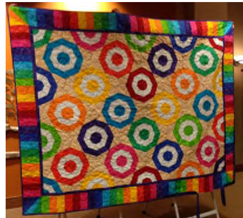
The 2016 Opportunity Quilt

Ladies, our Museum Quilt Show will be starting in July, and one of the fun duties we have is to sit or walk around the show, and be available to sell tickets for our Opportunity Quilt . We must be there, or tickets are not sold, for the museum staff cannot do that for us. Each time frame is only two and one half hours, starting at 9:00 am weekdays, 10:00 Saturdays, and 12 noon (two time frames) on Sunday. You can take a project you are working on, a book or magazine, and be ready to interact with our guests. So, bring your calendar, choose your date(s) and time(s), and be ready to sign up to enjoy yourself.